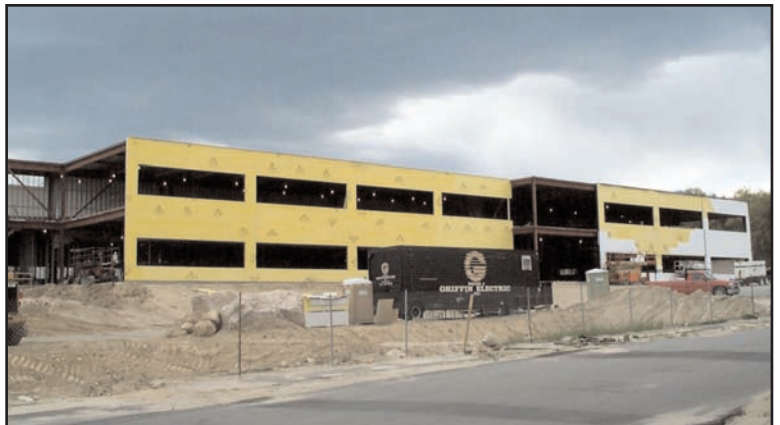
New Facility - Front elevation (May 15, 2001)

Our new 80,000 sf building is under construction and going strong. The state-of-the-art facility will allow us to expand our production and testing capabilities for our customers. At present, our administrative office are scheduled for move-in in November. Production staff and processes will move in 2002 once all validation work is complete. Watch our website at www.acciusa.com/happenings for new developments and building progress.