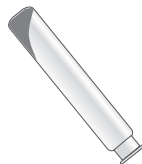
No Clot (-)